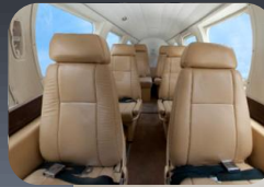
PIPER CHIEFTAIN PA31